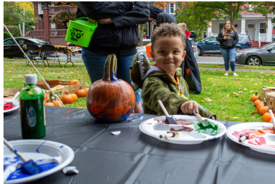
Eerie Fall Fest, October 21

Be sure to keep an eye out for upcoming events for the remainder of the year!