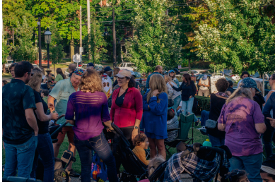
PorchFest, September 20

There were lots of fun events to close out summer and kick off fall in the West Bayfront! West Bayfront PorchFest featured 21 local bands on various porches and mobilized four local businesses! GIVE Day had over 100 Gannon students partnering with West Bayfront residents to do litter cleanups, park refreshes, boulevard work, and more. Eerie Fall Fest had another successful year with lots of smiling faces and awesome costumes!